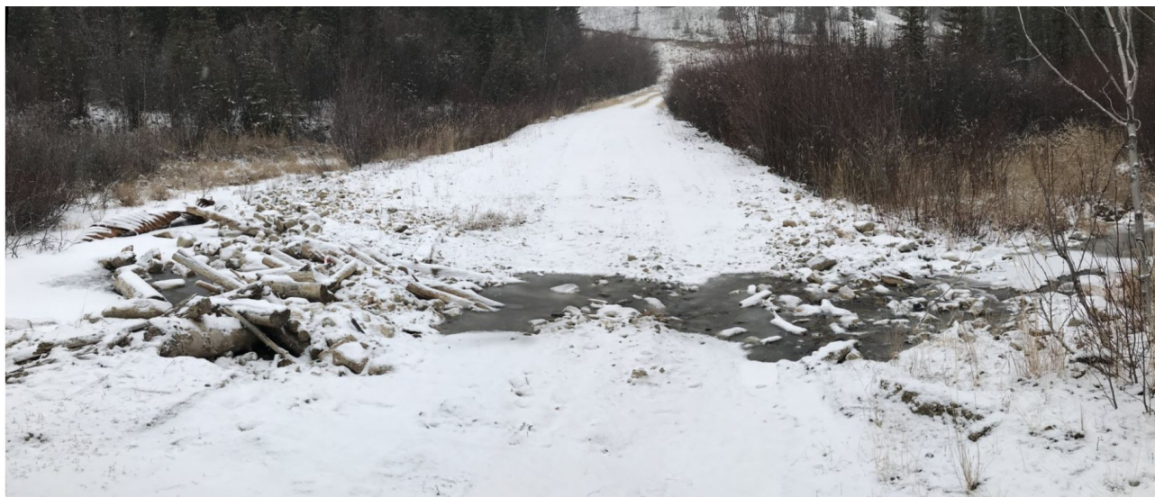
Photograph 15: Williams Creek Ford Crossing