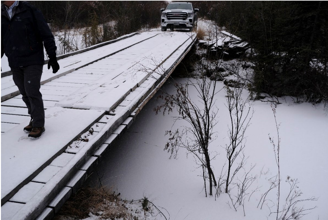
Photograph 17: Bridge Crossing at Merrice Creek – Upstream Side