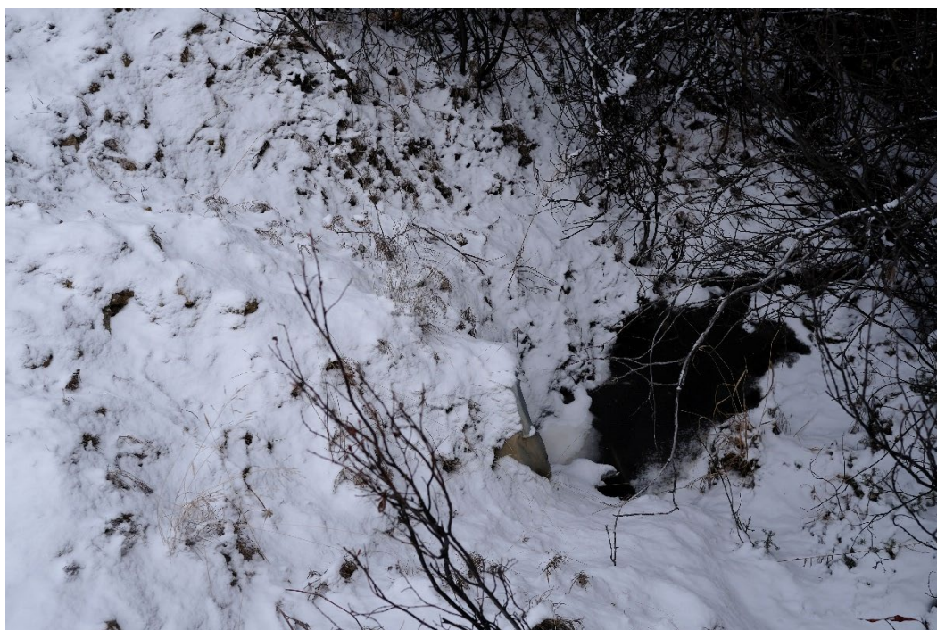
Photograph 14: Culvert Outlet beneath Road at North Williams Creek