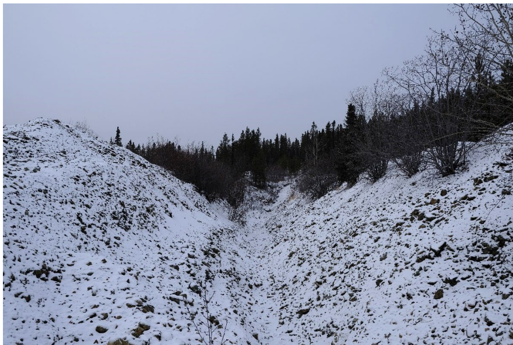
Photograph 9: Exploration Trench at the Discovery Outcrop