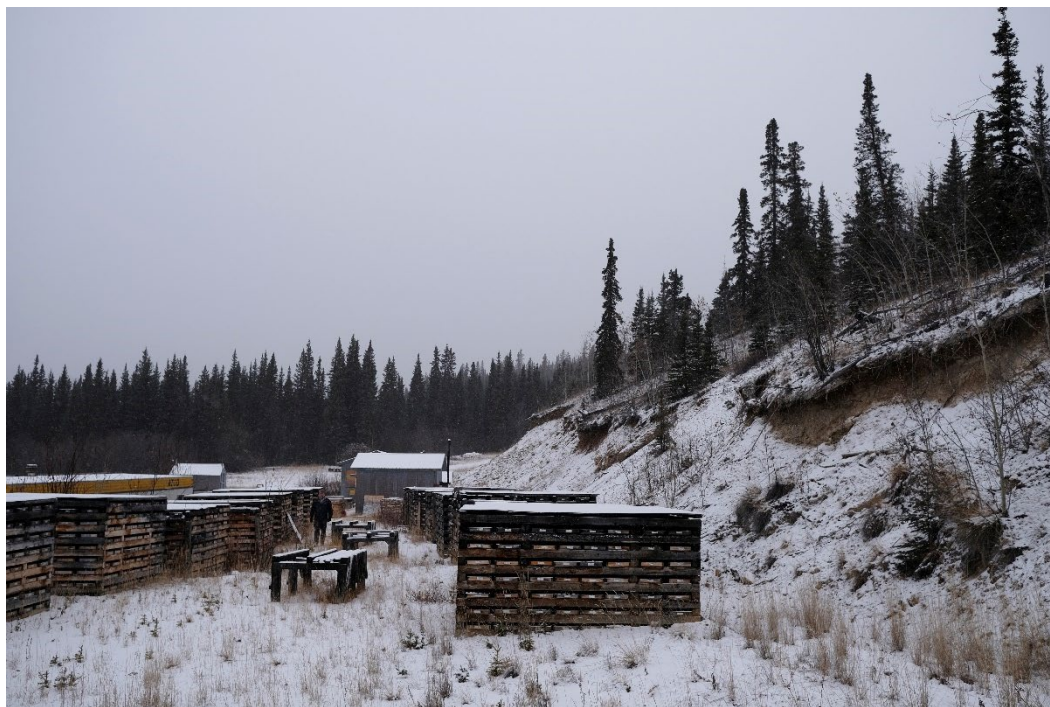
Photograph 3: Cut-slope behind Camp Geology Office and Core Shack