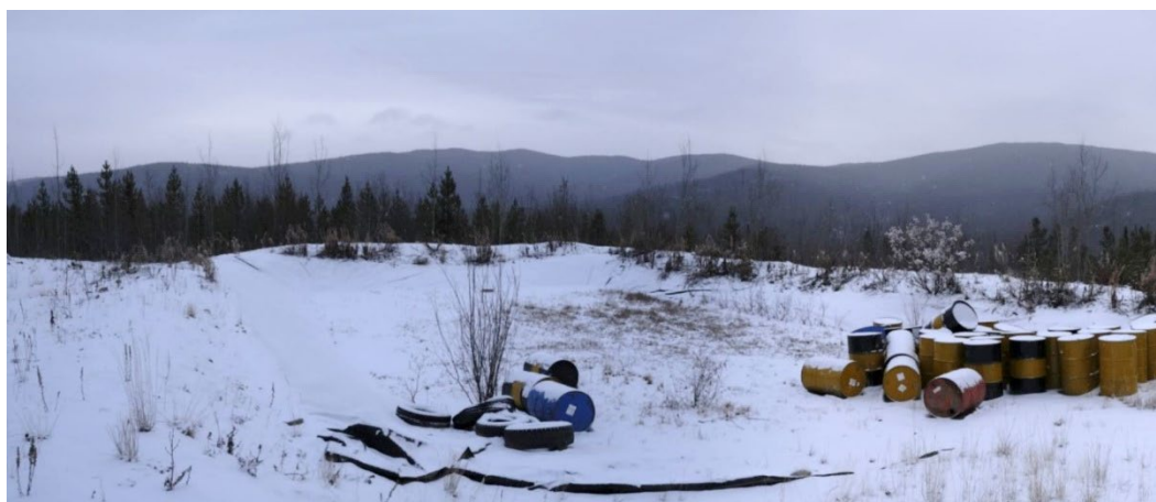
Photograph 10: Lined Basin at Fuel Storage Area