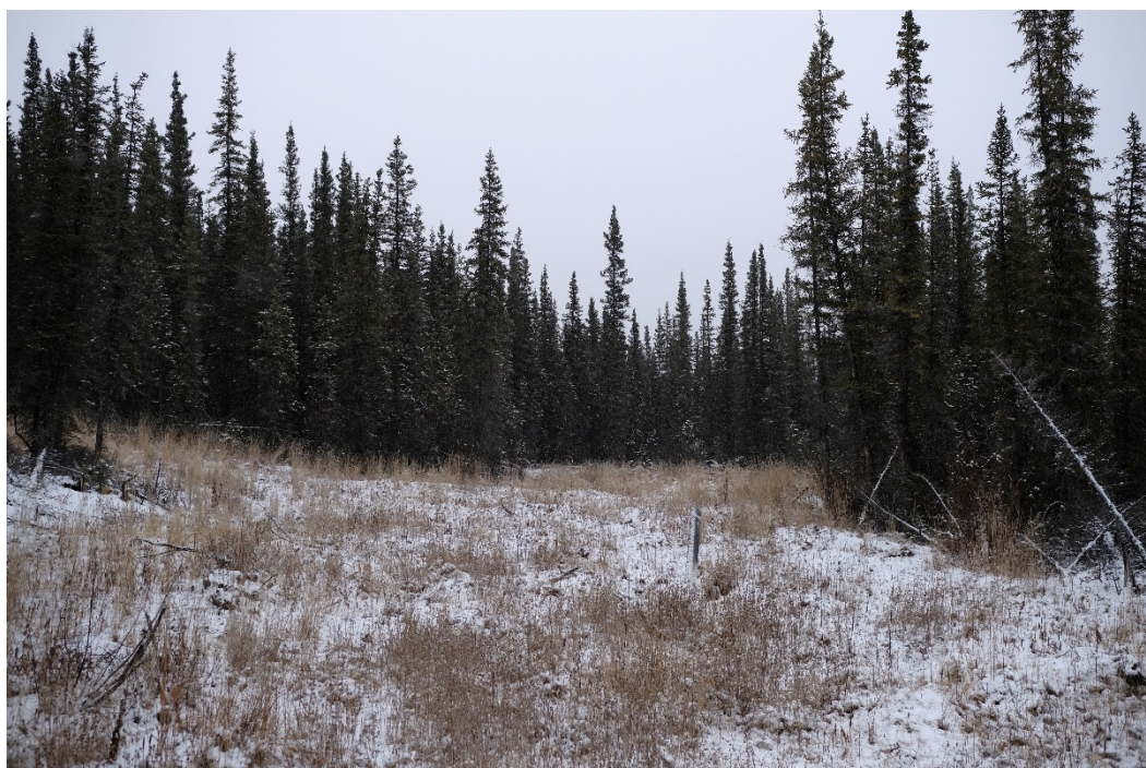
Photograph 6: Vegetation Regrowth in 2015 Drilling Area and Proposed Water Management Pond Area