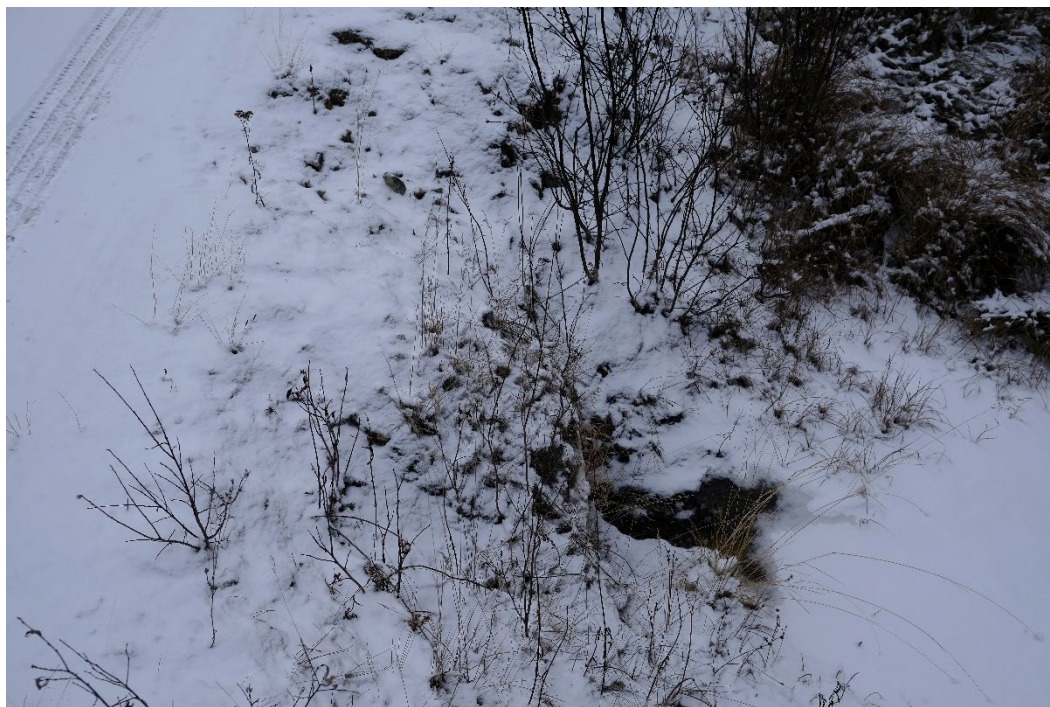
Photograph 13: Culvert Inlet beneath road at North Williams Creek