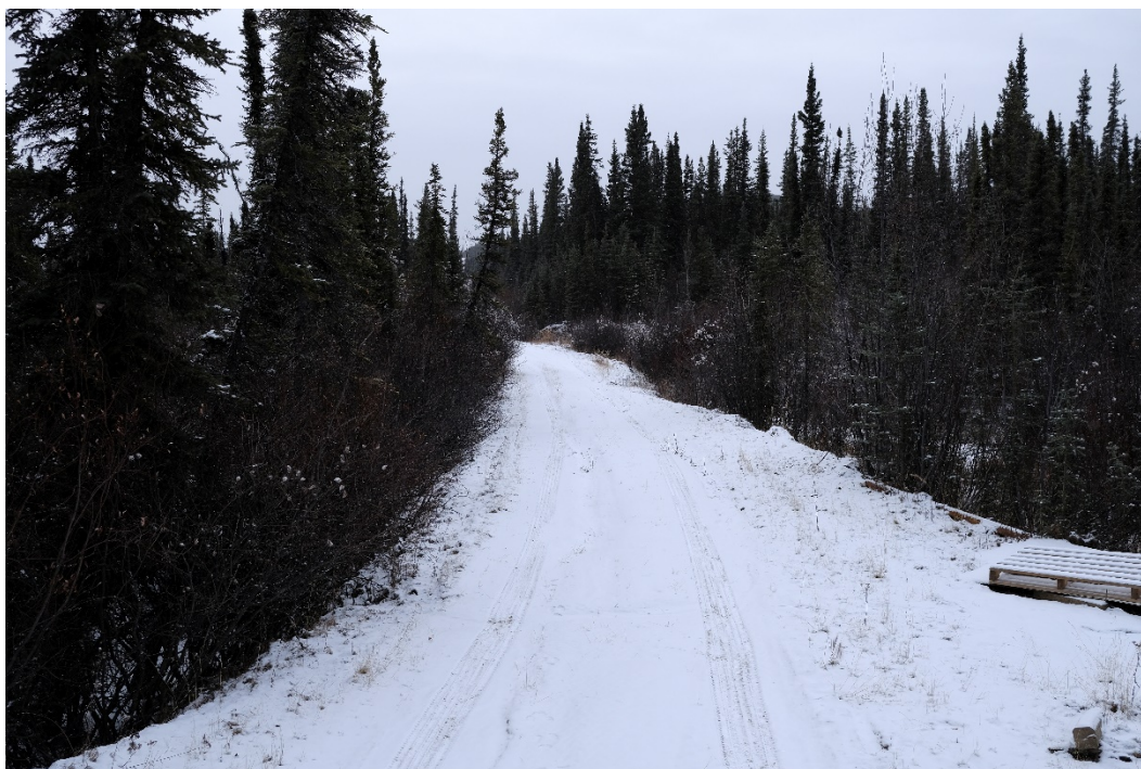
Photograph 12: Road Near North Williams Creek