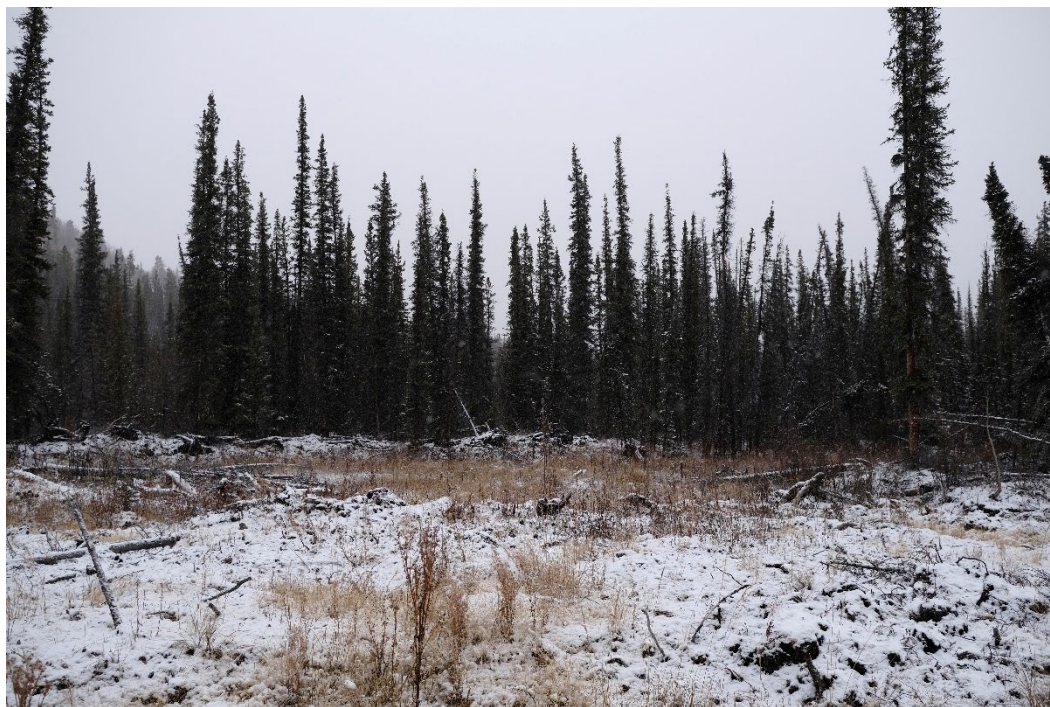
Photograph 7: 2017 Drilling Area and Vegetation Regrowth in Williams Creek Floodplain