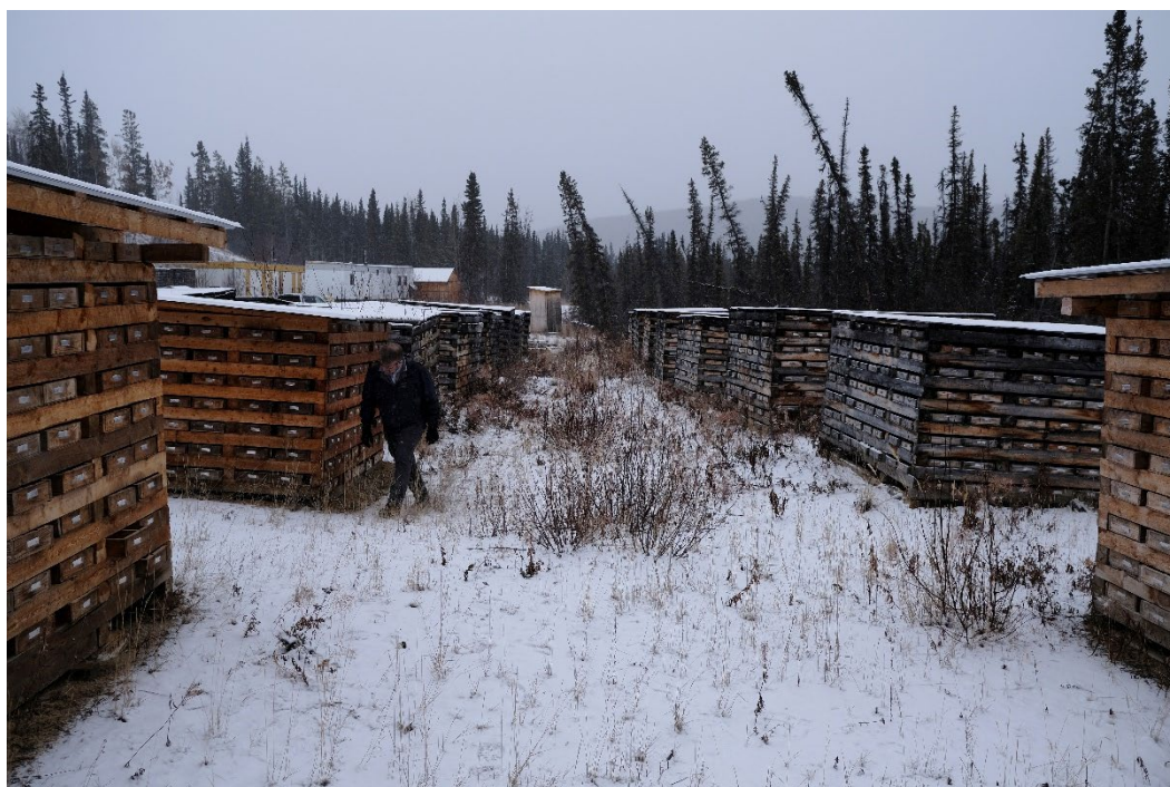
Photograph 2: Core Storage Racks