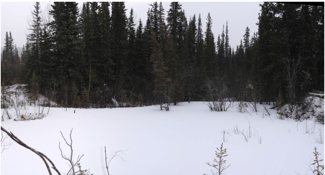
Photograph 18: Bridge Crossing at Merrice Creek – Downstream Beaver Dam