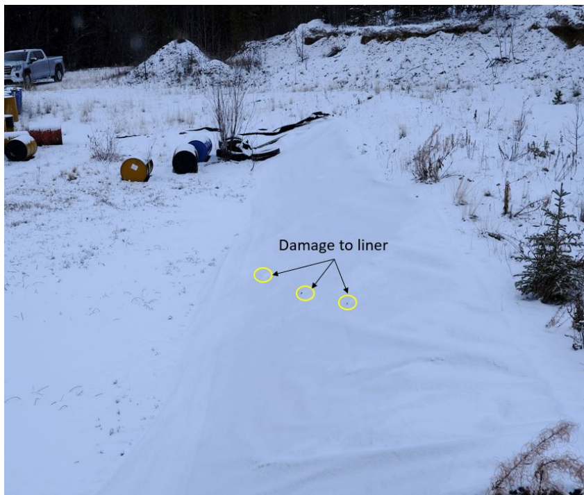
Photograph 11: Liner Damage at Fuel Storage Area