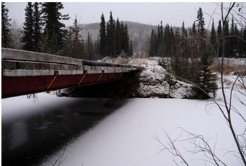
Photograph 16: Bridge Crossing at Merrice Creek – Downstream Side