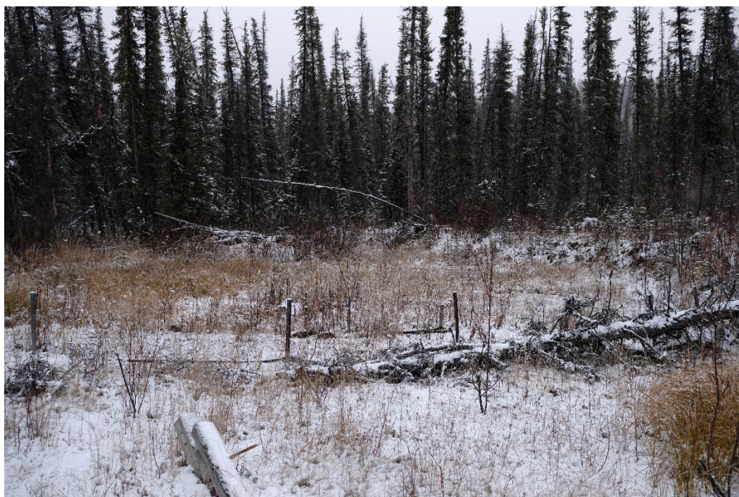
Photograph 8: Vegetation Growth around Sediment Fencing