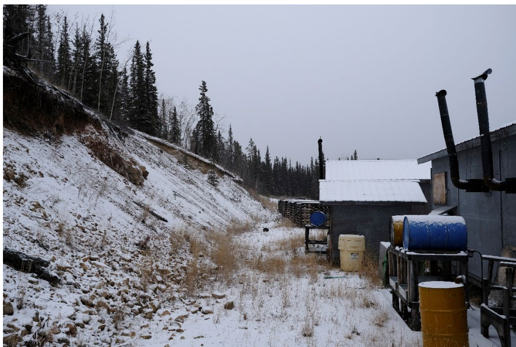
Photograph 4: Cut-slope behind the Camp Geology Office and Core Logging Shack