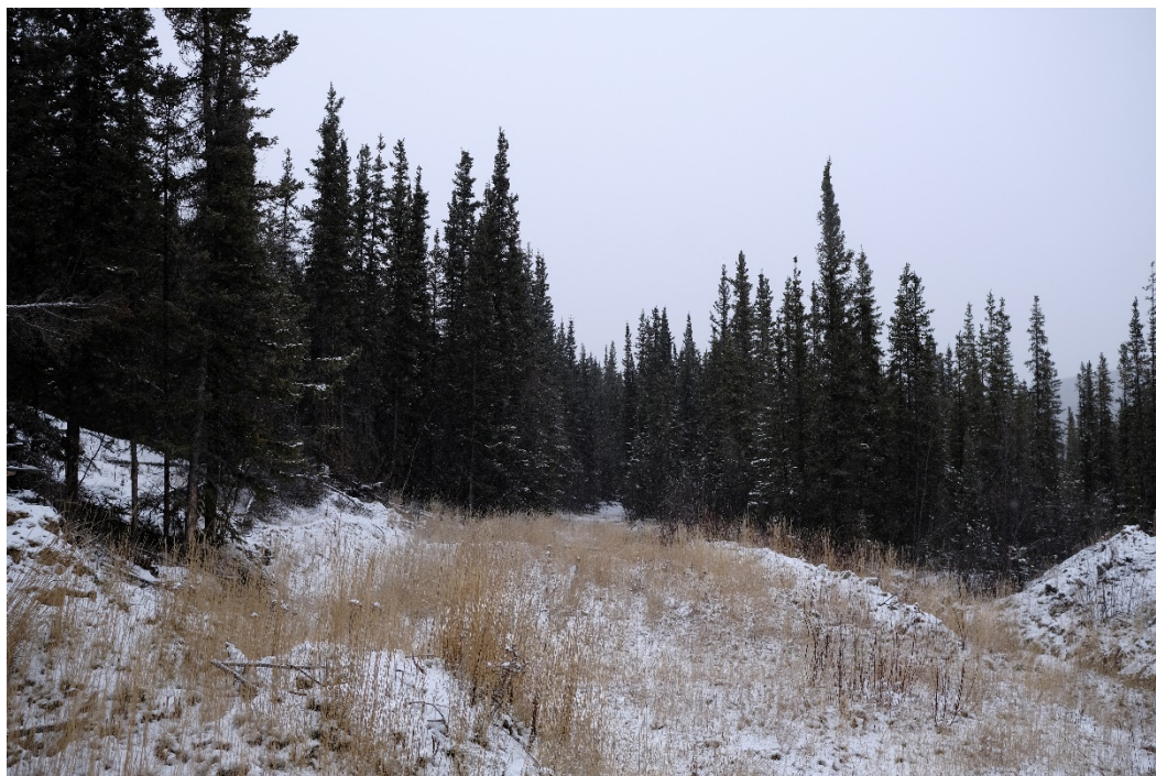
Photograph 5: Vegetation Regrowth on Access Roads