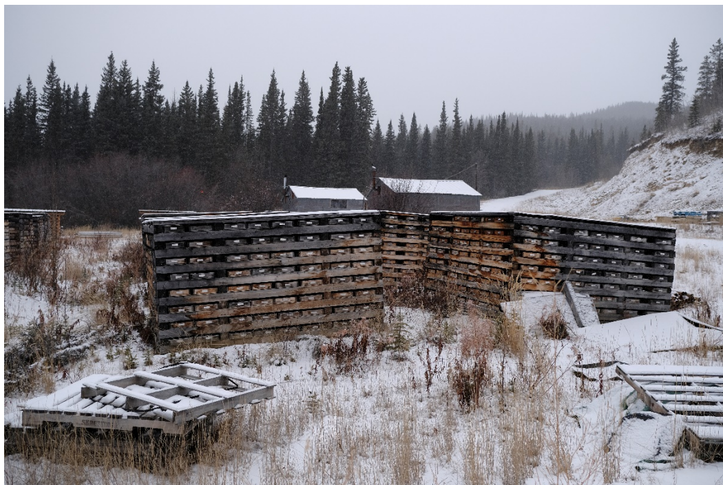
Photograph 1: Core Storage Racks