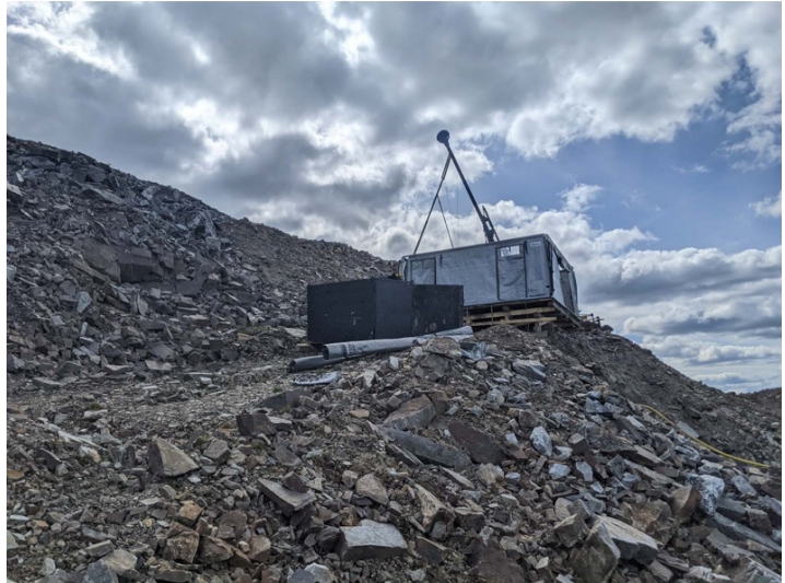
Photo 1. Diamond drill rig on prefabricated wooden platform on the Nabob claim (490248E / 7090888N).

During the 2022 field program diamond drilling of 2 holes was completed from a prefabricated, ~5m X 5m ( i.e. , 25 m 2 ) wooden, drill pad located on a previously constructed clearing (see Photo 1 , below). No disturbance occurred , and no heavy equipment was brought to site for pad construction. The wooden drill pad was removed upon completion of drilling. The drill was on site from July 27 th to August 1 st and drilling occurred from July 29 th to 31 st .