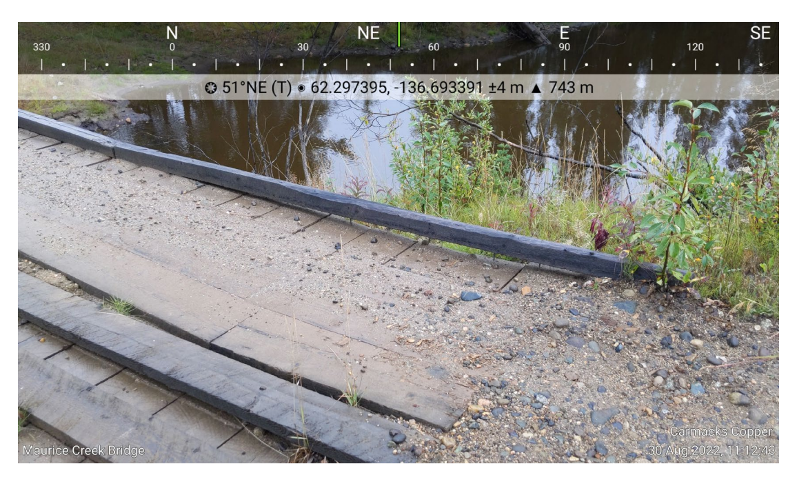
Photo 18: Damaged bridge rail - rail should be reattached to the bridge deck