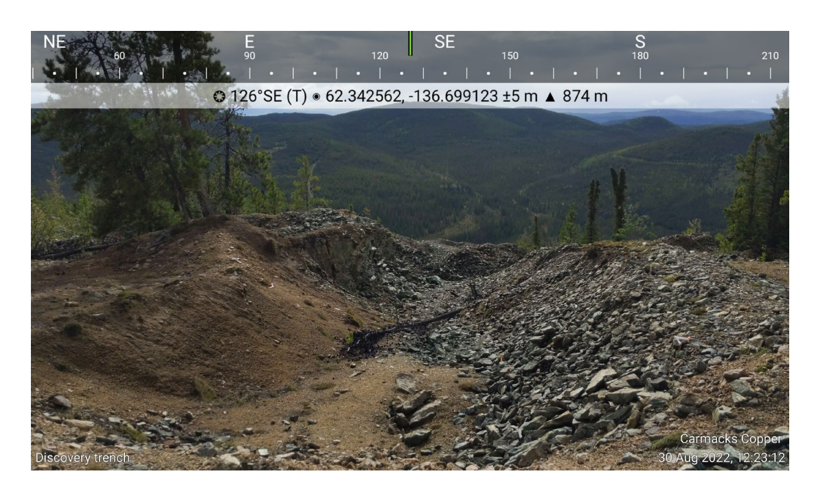
Photo 3: Discovery trench - sides of trench are sloped, trench is in satisfactory condition