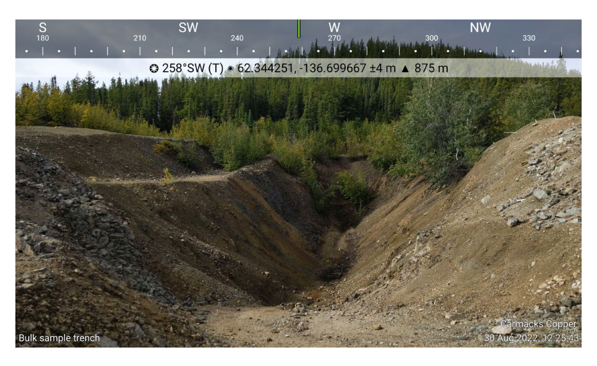
Photo 4: Bulk sample trench - sides of trench are sloped and benched, trench is in satisfactory condition